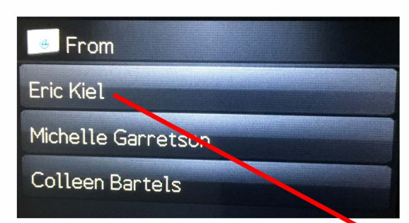
To send a scan, select your name