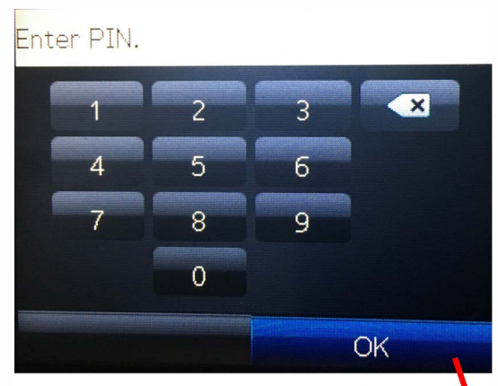
Under your name, type in your personalized pin, then press OK