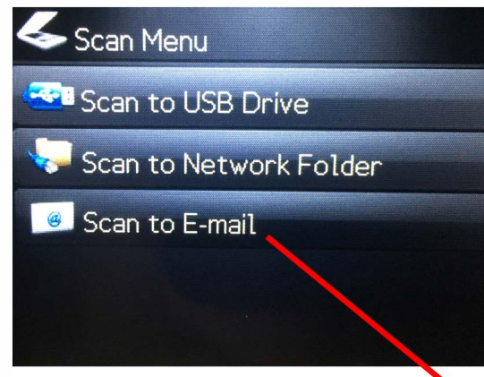
Under Scan, select Scan to E-mail